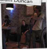
All Sorted Apollo 101