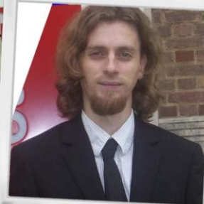
Volunteering: My Experience