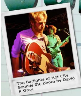
The Barlights at Hot City Sounds 09, photo by David R. Gray.

Name: The Barlights EP Title: "Recommended Songs Lovingly Picked by The Barlights EP (We don't do catchy names too well...)" Tracks: The Brownies - Cry Yourself To Sleep Tin Man - Illusion The Vegas Fame Index - Shot of You Cross Country Driver - Hey Red