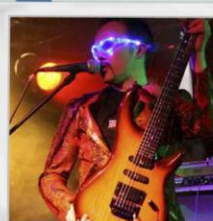
All Pink on the Inside