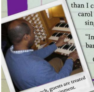
During lunch, guests are treated to a variety of entertainment.