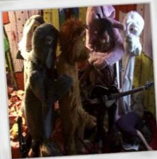
The Brownies - Dance Romance