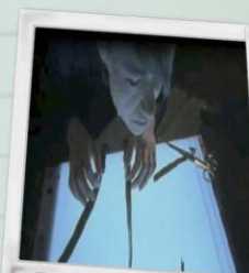
The Neutrinos - Build Him 'til He Breaks