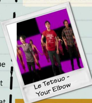
Le Tetsuo - Your Elbow

Have fun in 2010 - and keep listening to BBC Norfolk Introducing!