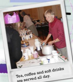
Tea, coffee and soft drinks are served all day.