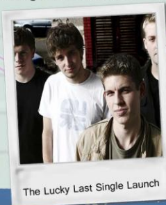
The Lucky Last Single Launch

With a KLFM session too – there seemed only two more things to ask. Savoury or Sweet and Blancmange or Custard? "Savoury all the way! And custard, definitely custard."